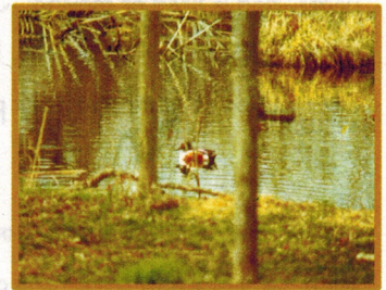
Northern Shoveler visiting briefly