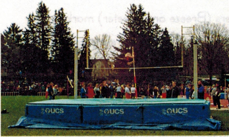
Crystal pole vaulting at St. Olaf.