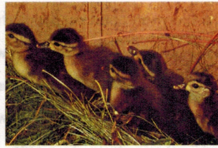
Newly hatched wood ducks.